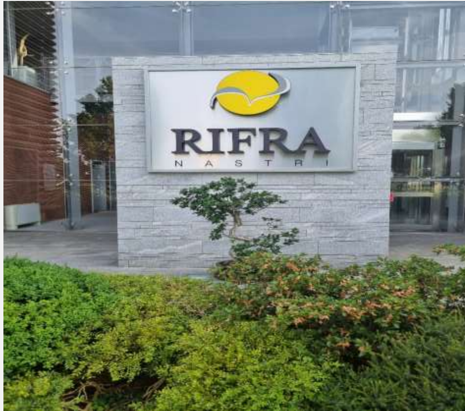
Headquarter in Concorezzo (Italy)