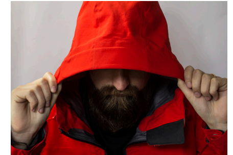
Bonded stiffer hood brim. / LB600