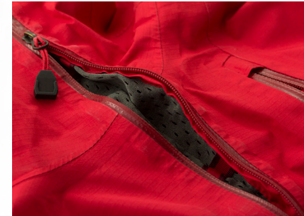
Bonded zipper with ventilation mesh. / LB600