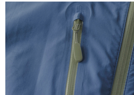
Bonded waterproof zipper with hood. / LB600