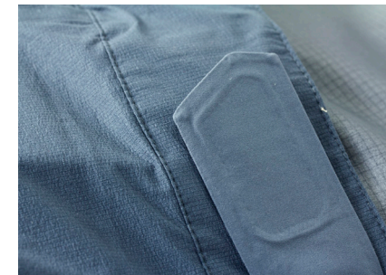
Bonded stiff half belt with embossed grip. / LB600