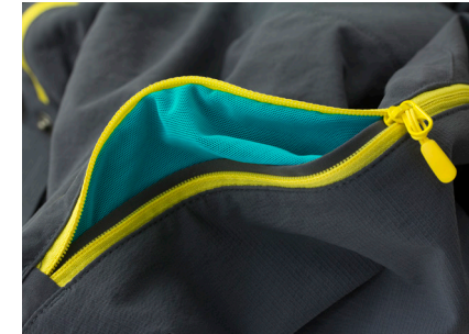
Bonded zipper with ventilation mesh. / LB700