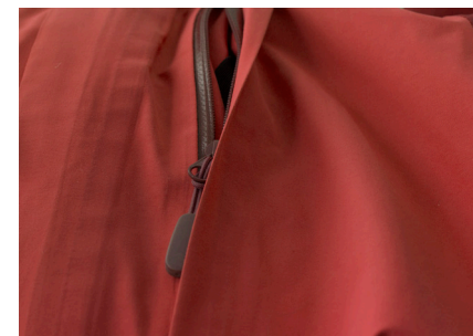
Bonded stiff waterproof zipper lid. / LB600