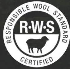
RWS Merino Wool