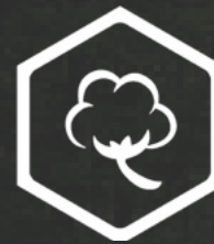
Organic / BCI Cotton