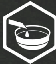
Natural Rubber Outsole